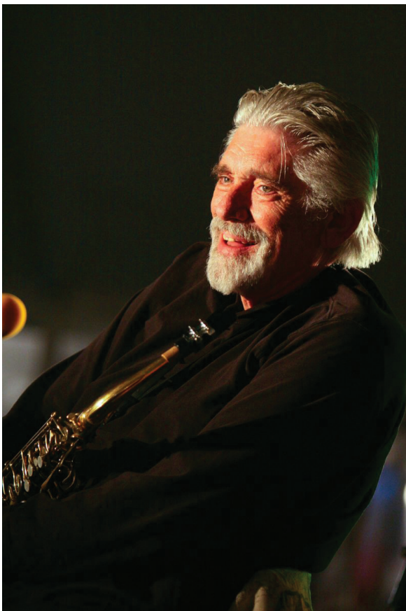
Med Flory in 2007.