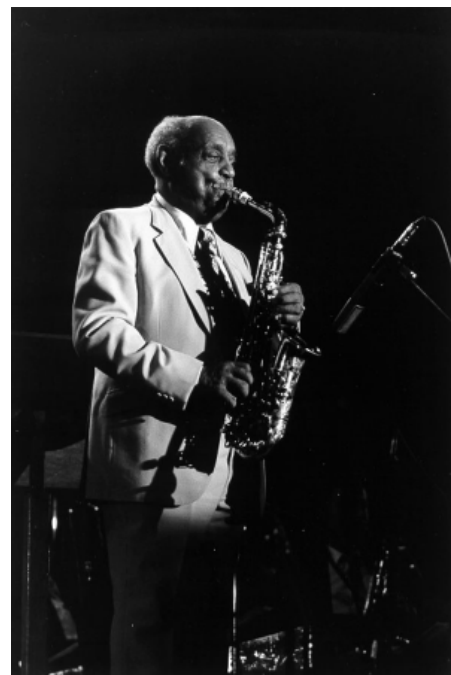
Benny performing in Japan, 1989