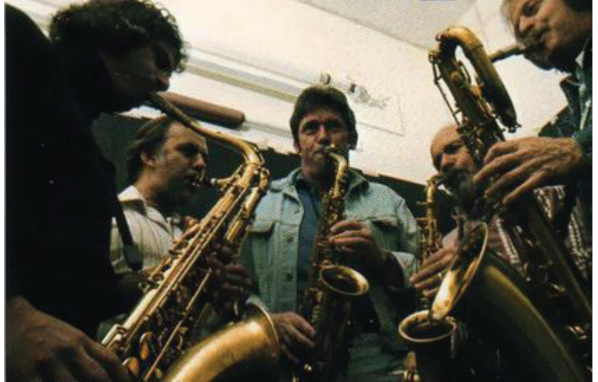
Cover photo from the 'Joy of Sax' album.