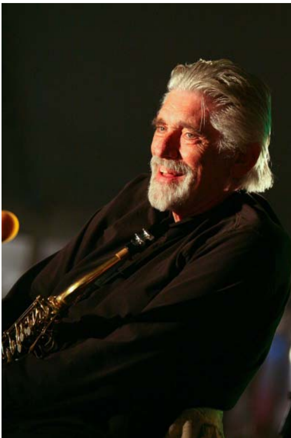
Med Flory in 2007.