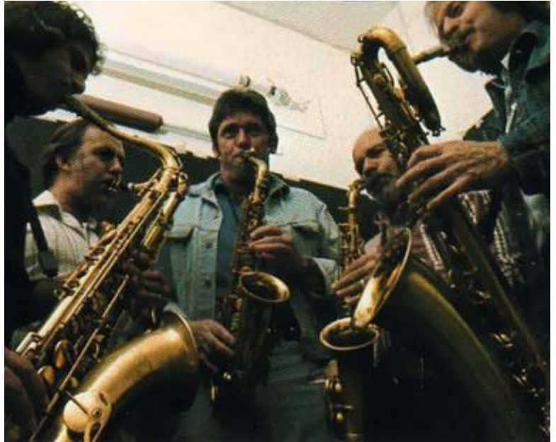
Cover photo from the 'Joy of Sax' album.