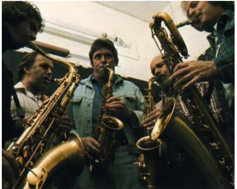
Cover photo from the 'Joy of Sax' album.