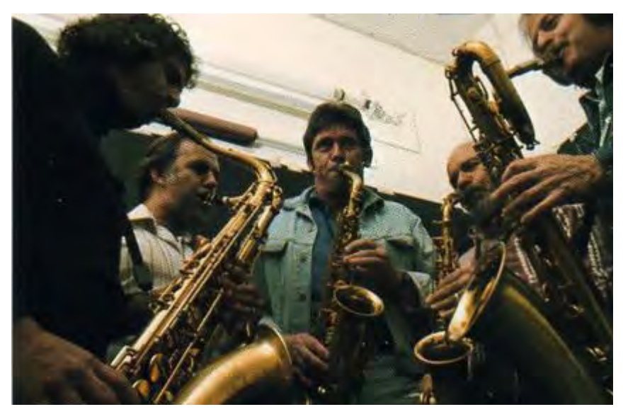
Cover photo from the 'Joy of Sax' album.