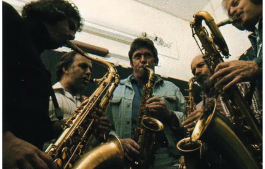
Cover photo from the 'Joy of Sax' album.