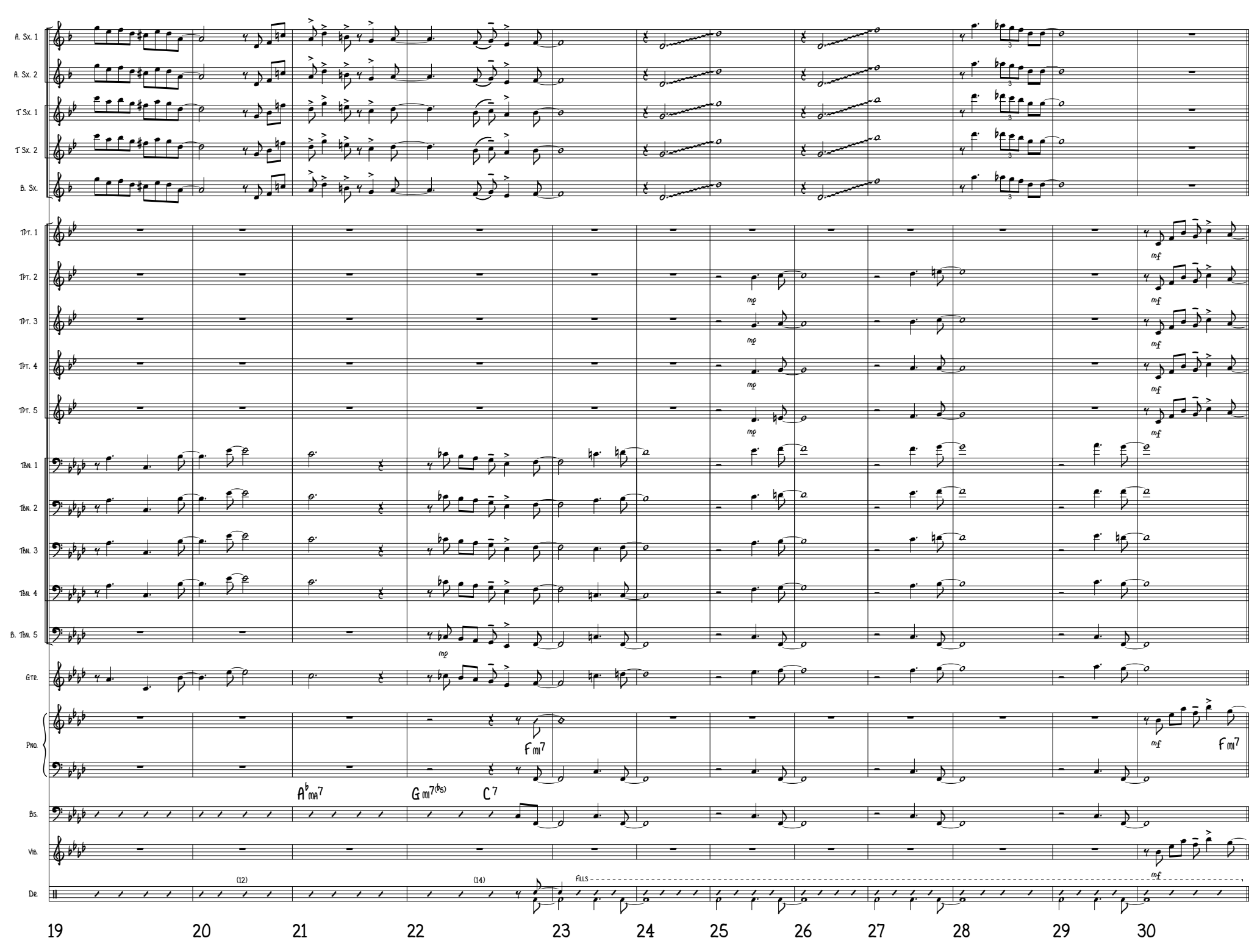
Score - Page 3