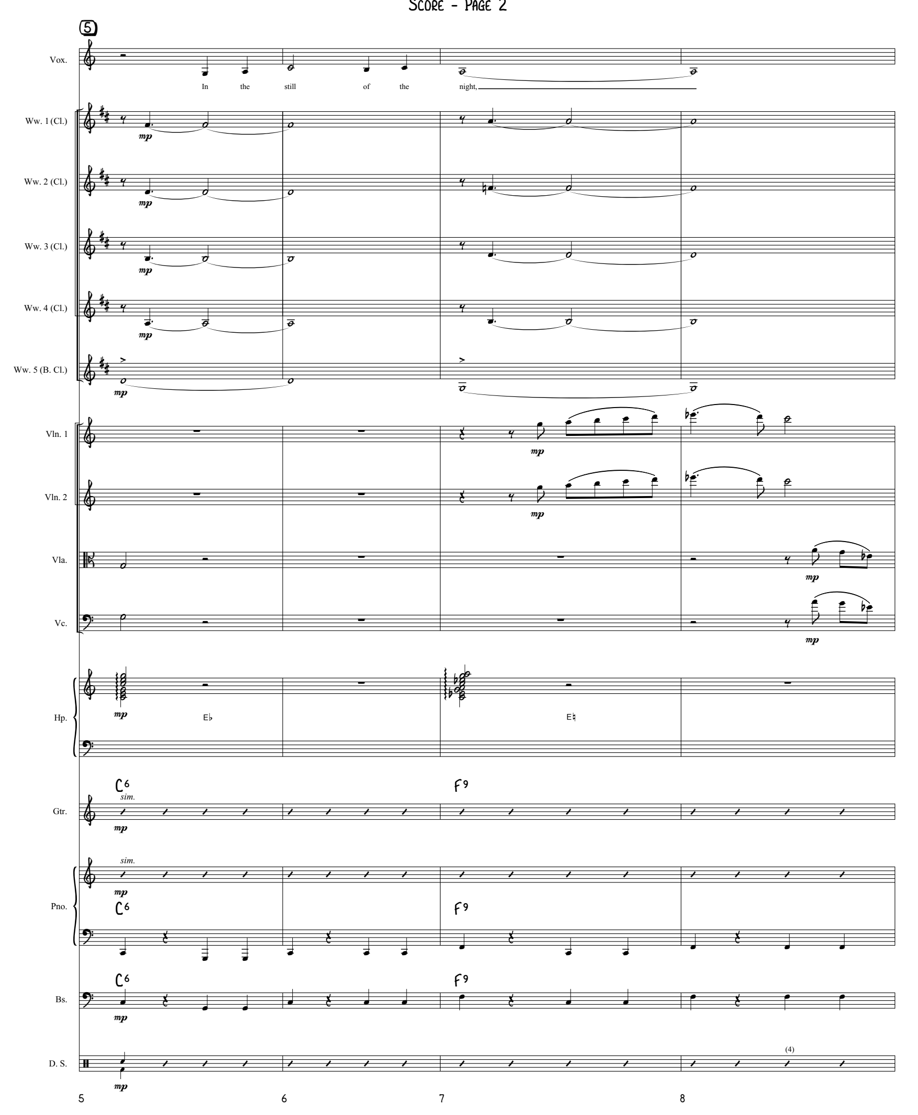
IN THE STILL OF THE NIGHT Score - Page 2