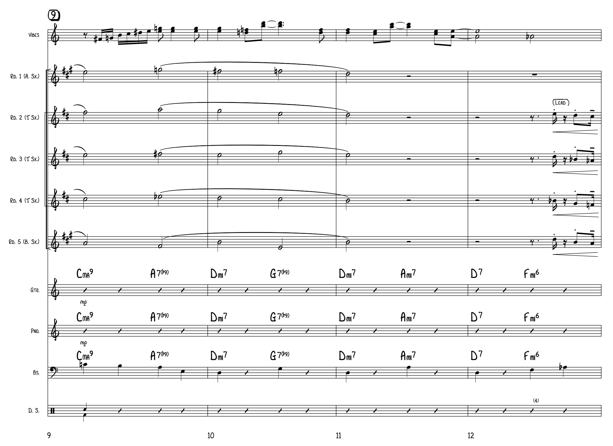
Score - Page 3