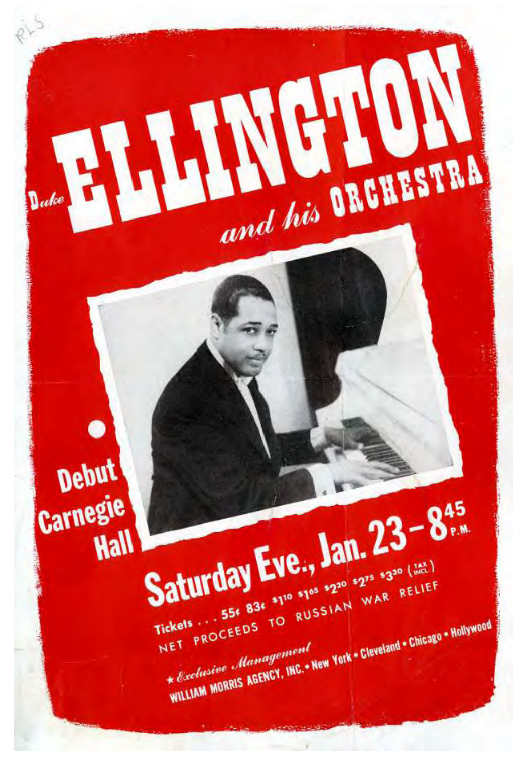
This is an original advertisement for the 1943 Carnegie Hall concert.

management of the William Morris Agency, Inc.)