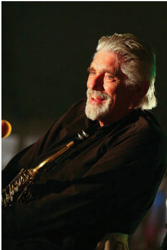
Med Flory in 2007.