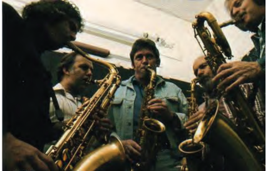
Cover photo from the 'Joy of Sax' album