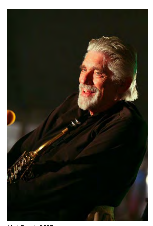
Med Flory in 2007.