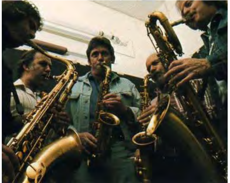
Cover photo from the 'Joy of Sax' album.