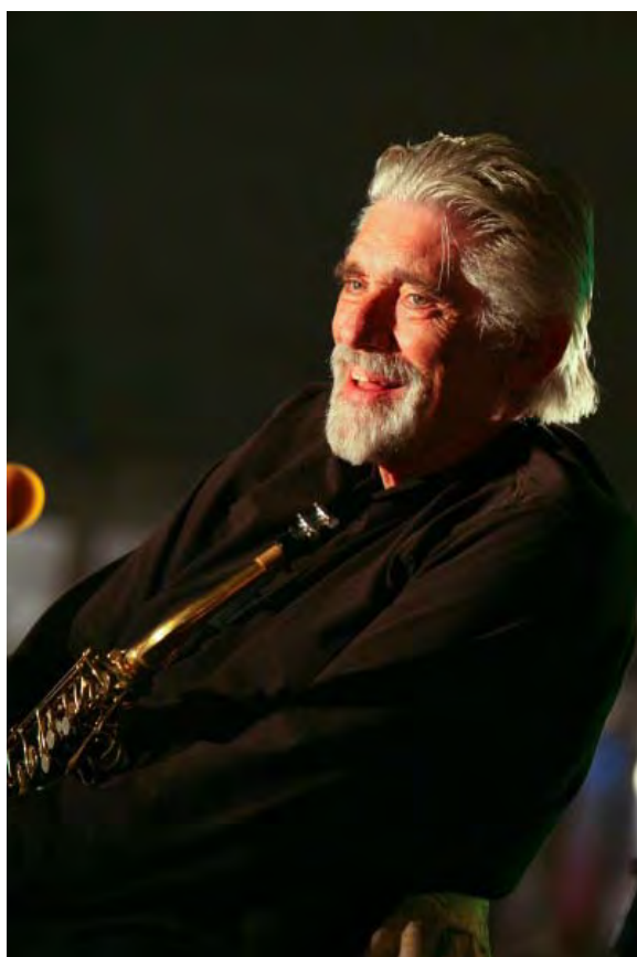
Med Flory in 2007.