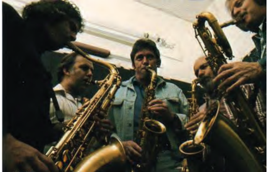
Cover photo from the 'Joy of Sax' album