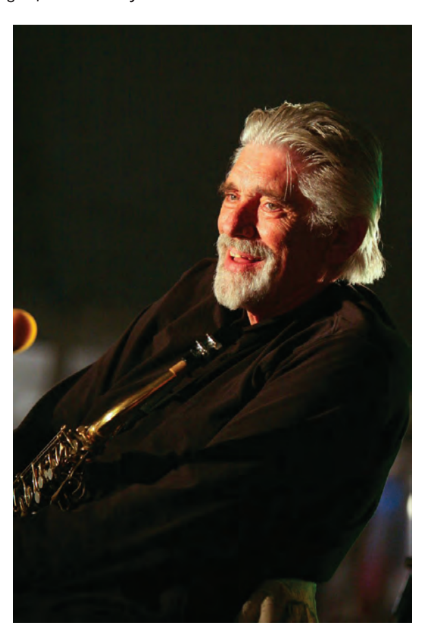
Med Flory in 2007.