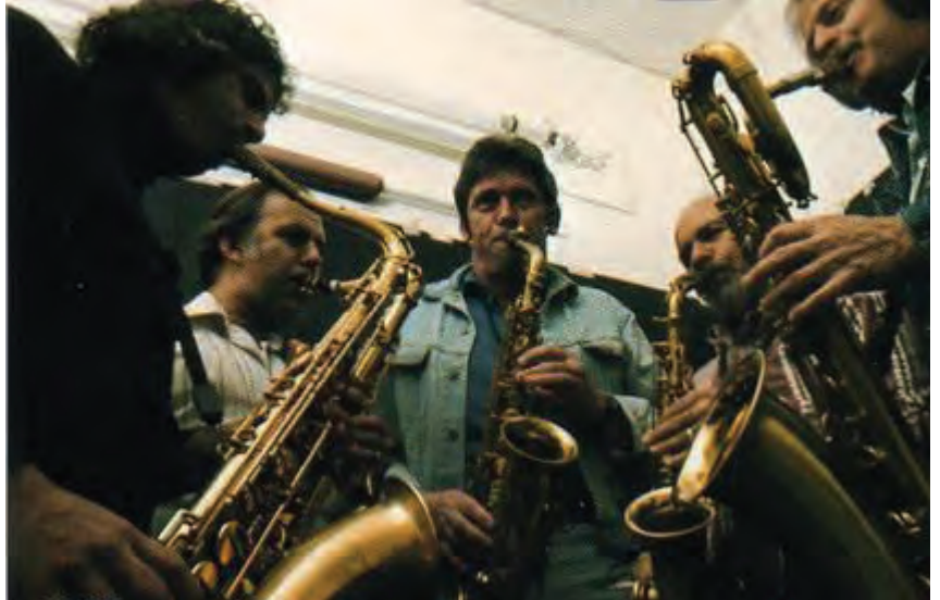
Cover photo from the 'Joy of Sax' album.