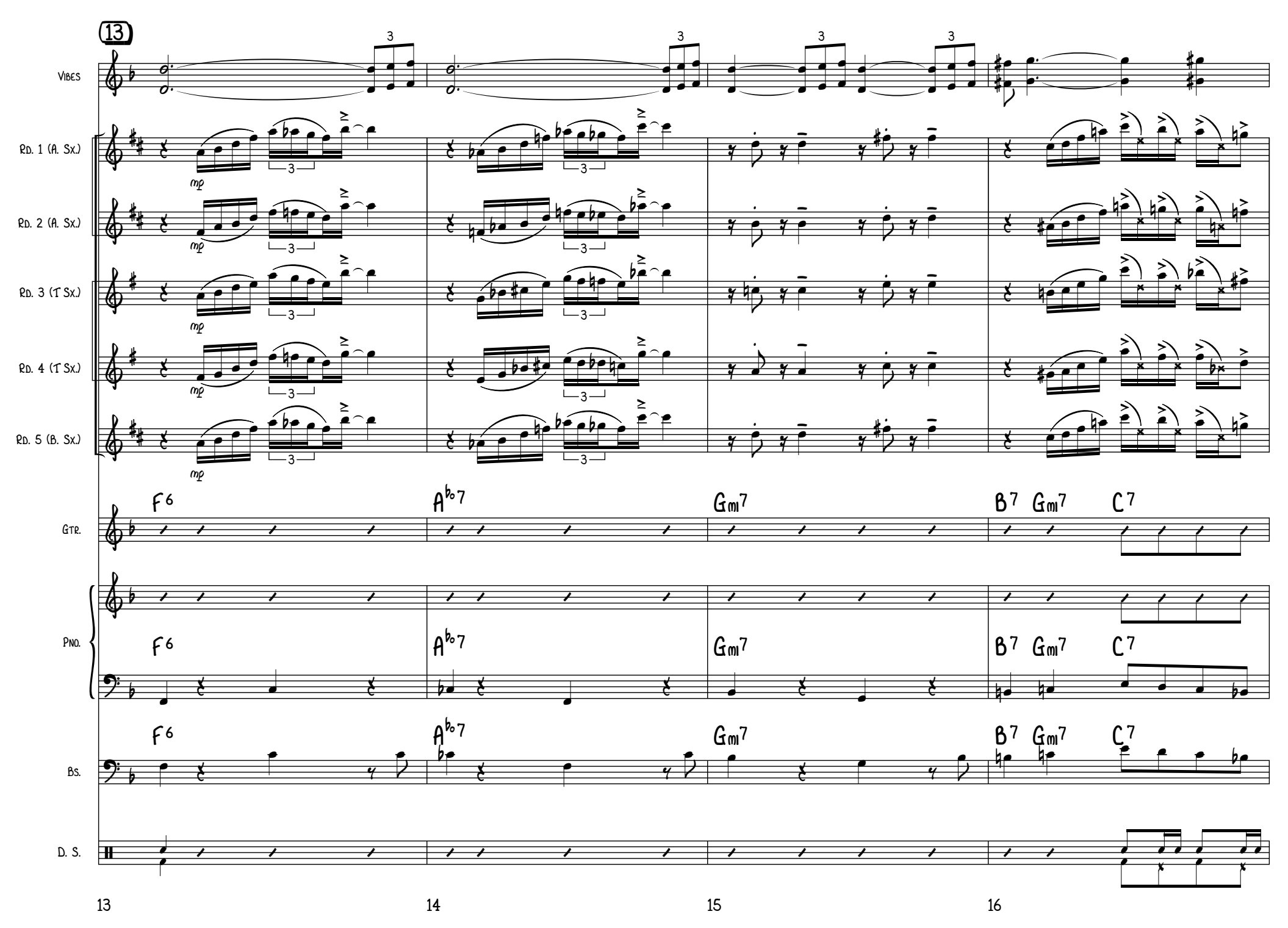
Score - Page 3