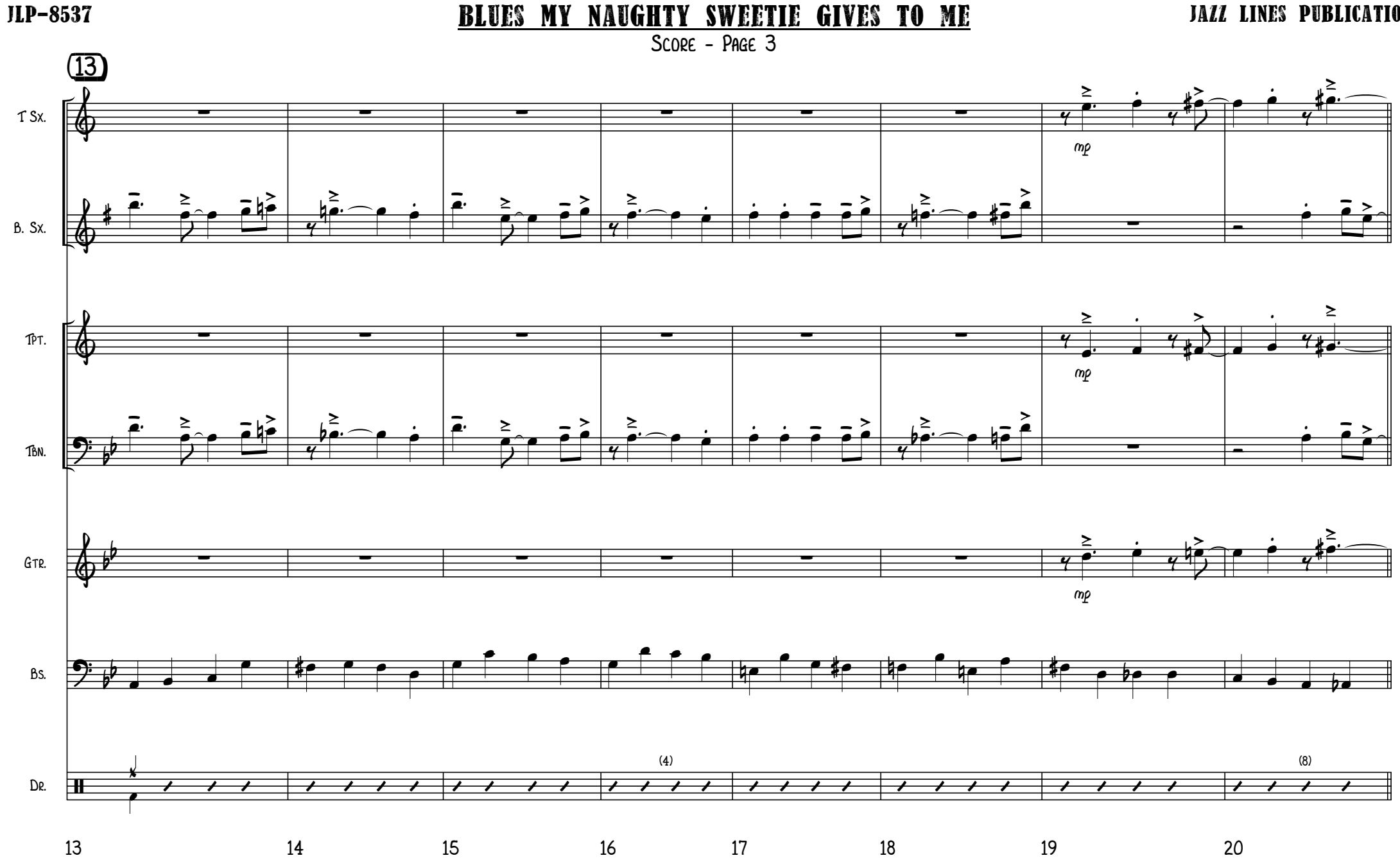
NAUGHTY SWEETIE GIVES TO ME BLUES MY