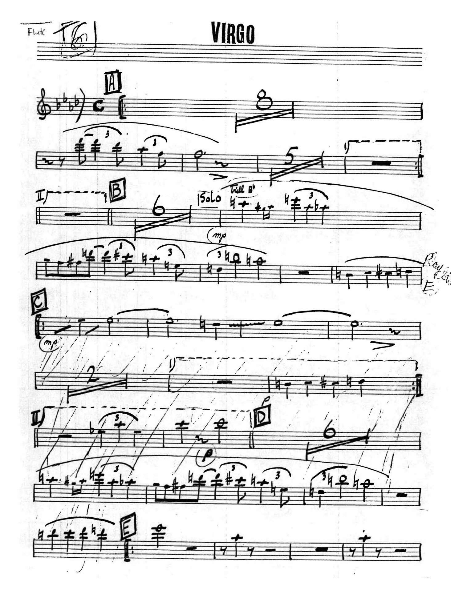
Above is the original first page of the flute part for Virgo.