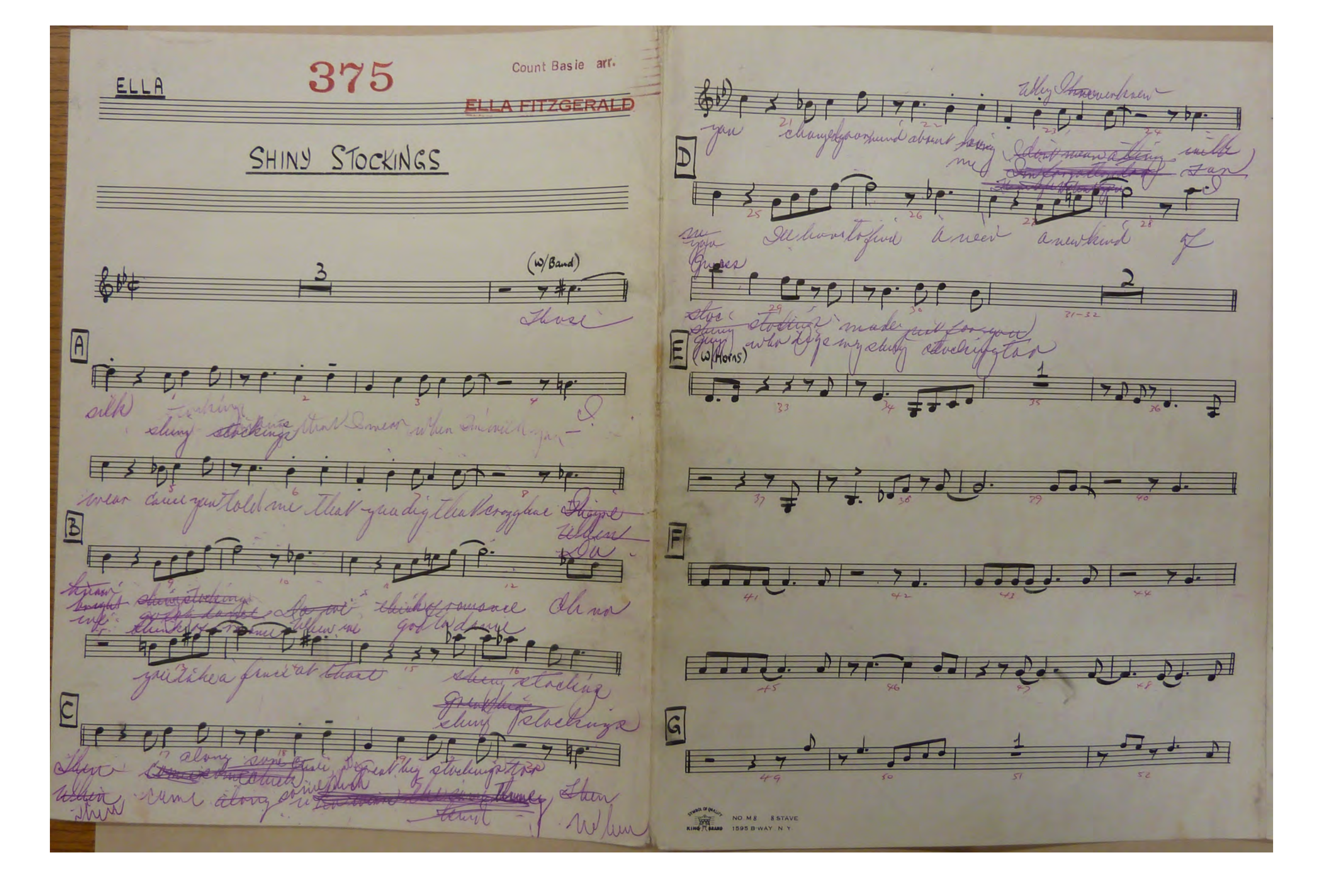
Here is Ella Fitzgerald's lyric sheet that she used for the 1963 recording with the Count Basie Orchestra.