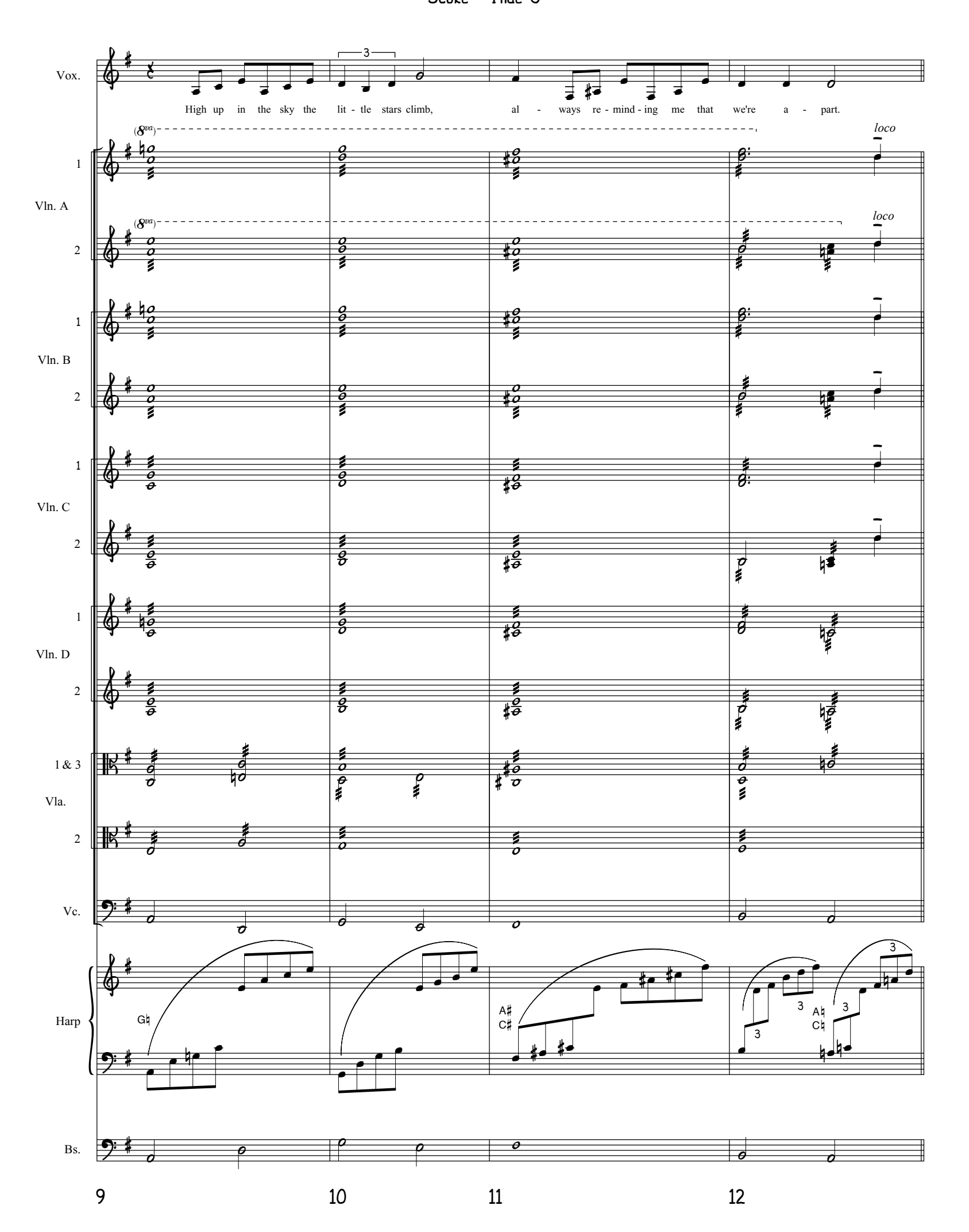
STARDUST Score - Page 3