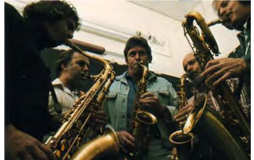
Cover photo from the 'Joy of Sax' album.