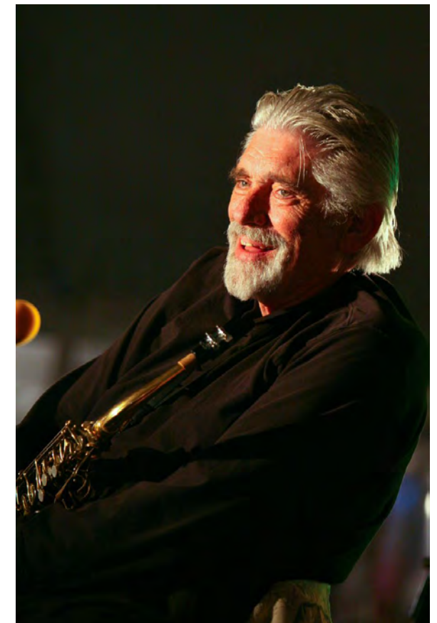
Med Flory in 2007.