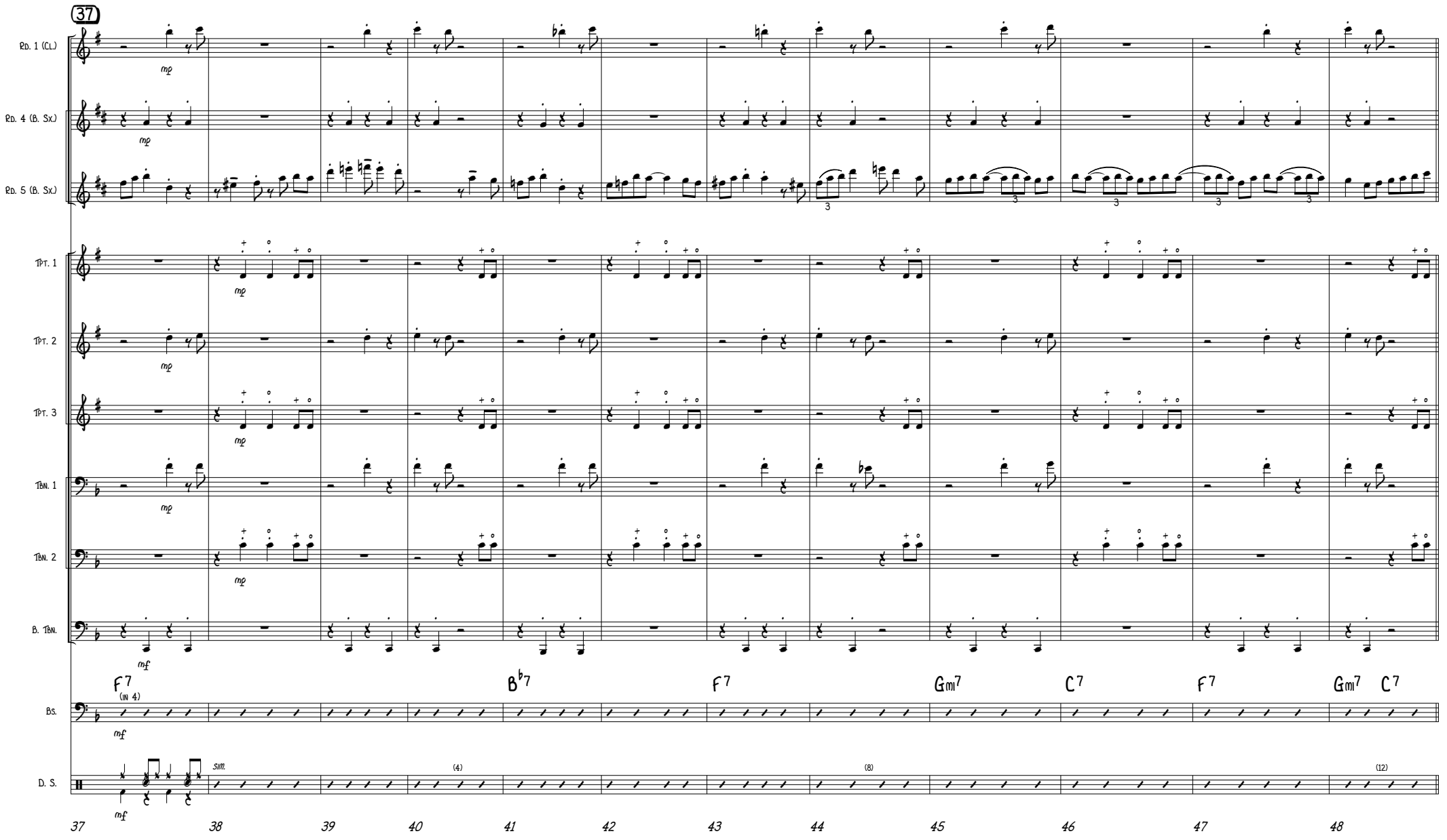
SCORE - PAGE 3