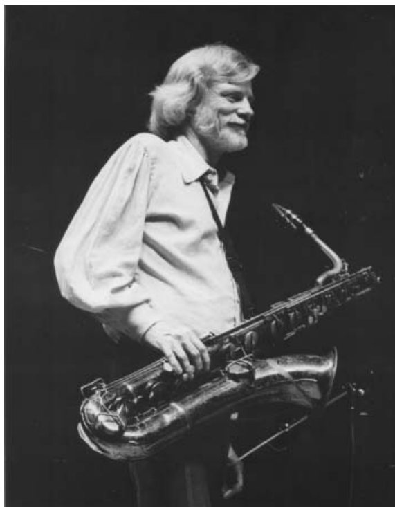
Gerry Mulligan, 1979

One of the musicians whom everyone envisioned in the trumpet chair was Miles Davis. Not only was Davis interested, he took the ensemble over, calling rehearsals and getting the band a gig at the Royal Roost. By that time Mandel had gone to California to establish residency there, but everyone else contributed music. Mulligan wrote the most material that was recorded, but for many years his considerable contribution to this ensemble was not properly acknowledged.