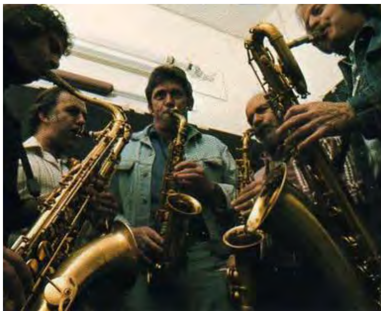
Cover photo from the 'Joy of Sax' album.