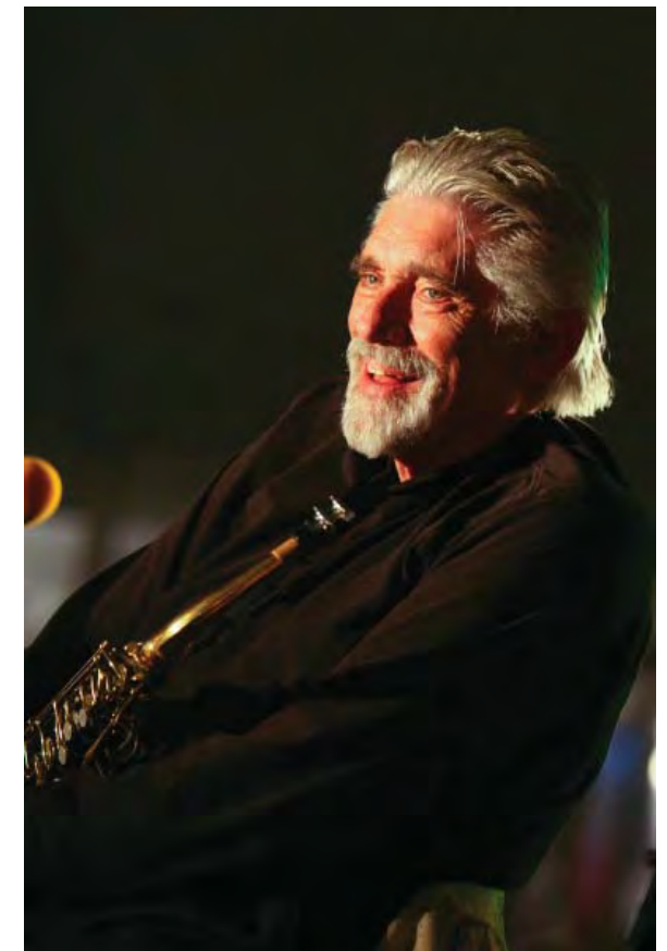
Med Flory in 2007.